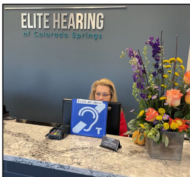
Elite Hearing of Colorado Springs Colorado Springs, CO