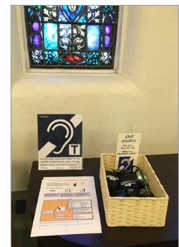
First Congregational Church, Boulder, CO