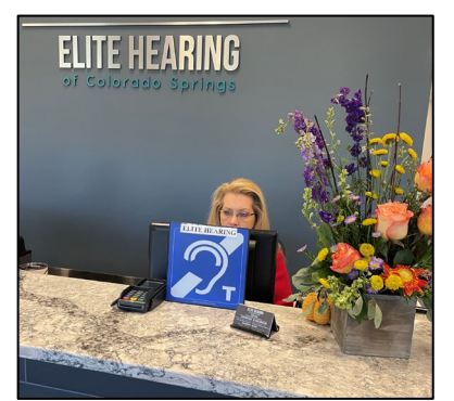
Elite Hearing of Colorado Springs Colorado Springs, CO